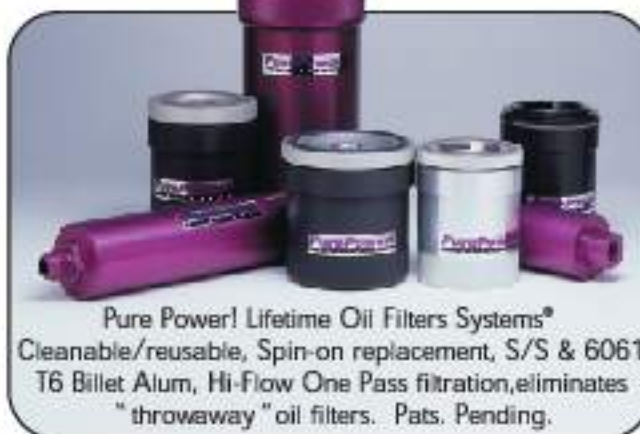
Pure Power! Lifetime Oil Filters Systems® Cleanable/reusable, Spin-on replacement, S/S & 6061 T6 Billet Alum, Hi-Flow One Pass filtration, eliminates "throwaway" oil filters. Pats. Pending.

Pure Power! Incorporated designs and manufactures revolutionary gasoline and diesel engine performance products engineered to have a positive impact on the environment. Pure Power! Extreme High Performance Products are used by World Champion Racers and have broken World Records on land, air and sea. (NASCAR, BUSCH, NHRA, IHRA, CRAFTSMAN TRUCKS, MTRA, PACIFIC OFFSHORE RACING, APBA, GOLD CUP AIR RACING, etc).