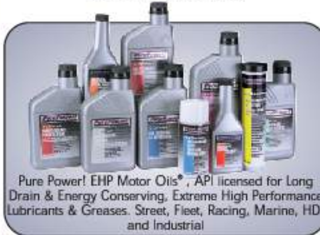
Pure Power! EHP Motor Oils®, API licensed for Long Drain & Energy Conserving, Extreme High Performance Lubricants & Greases. Street, Fleet, Racing, Marine, HD, and Industrial

Pure Power! Lifetime Oil Filters & Extreme High Performance Lubricants are a winning combination to save money, equipment, time and the environment!